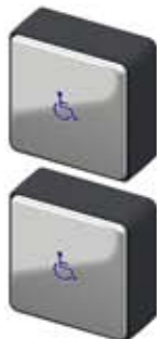
4-1/2" Stainless Wireless Push Buttons