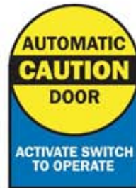
ANSI Door Signs