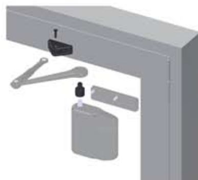
Pull Side Mounting Hardware