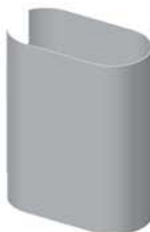
Aluminum Dress Cover