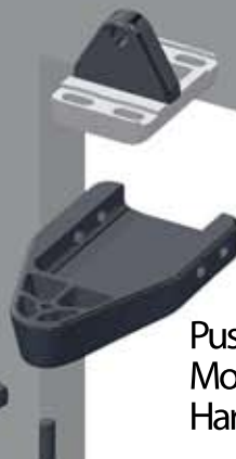
Push Side Mounting Hardware