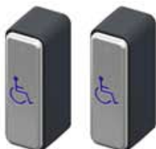
1-3/4" Stainless Wireless Push Buttons