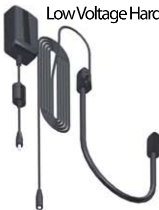
Low Voltage Hardwire Kit